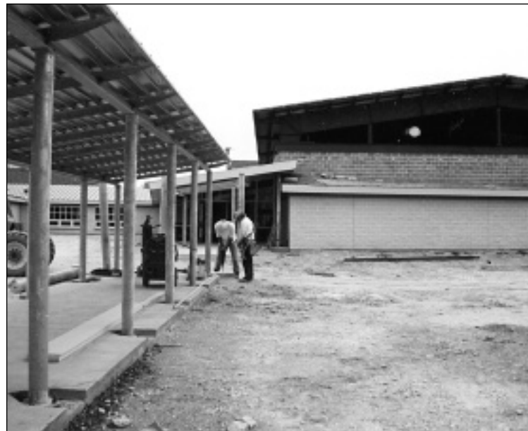
ON SCHEDULE — The almost-15,000 sq. ft. Indoor Recreation Center is being built with a Texas Parks and Wildlife Dept. matching grant.

But the real star will be the long-awaited recreation center. Tours will give you a first look at what's sure to be longtime center of activity for Wells Branch.