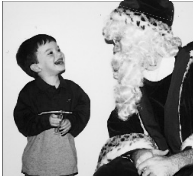
A young Wells Branch resident greets Santa, dressed in his Victorian-era costume, during the Nov. 16 Thanksgiving Feast.