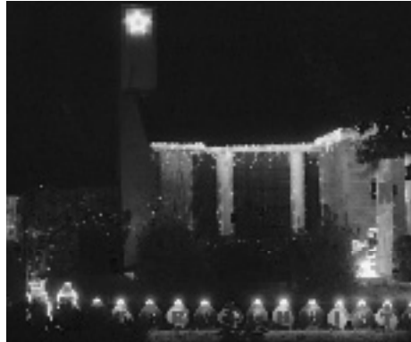
MOST TRADITIONAL: 2102 Nathan Ln.