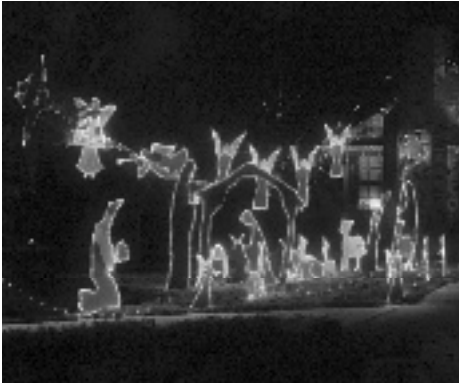
MOST BEAUTIFUL: 14409 Oceanna Ct.