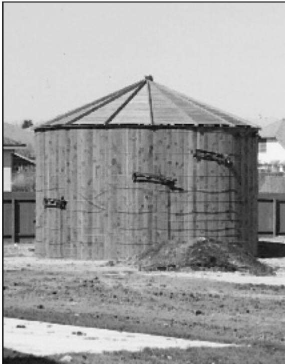
NEW RAINWATER COLLECTION TANK