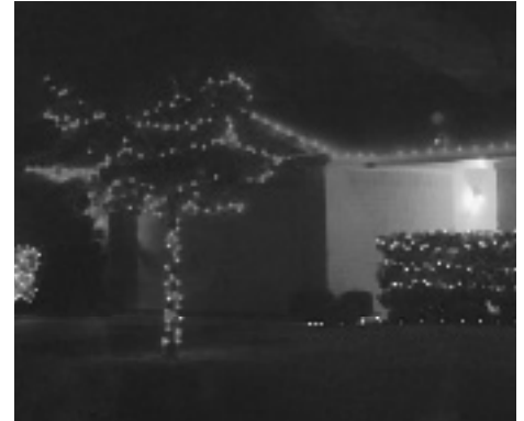
MOST PATRIOTIC: 3916 Sambuca Ct.