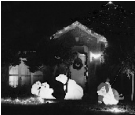
MOST ORIGINAL: 14909 Bescott